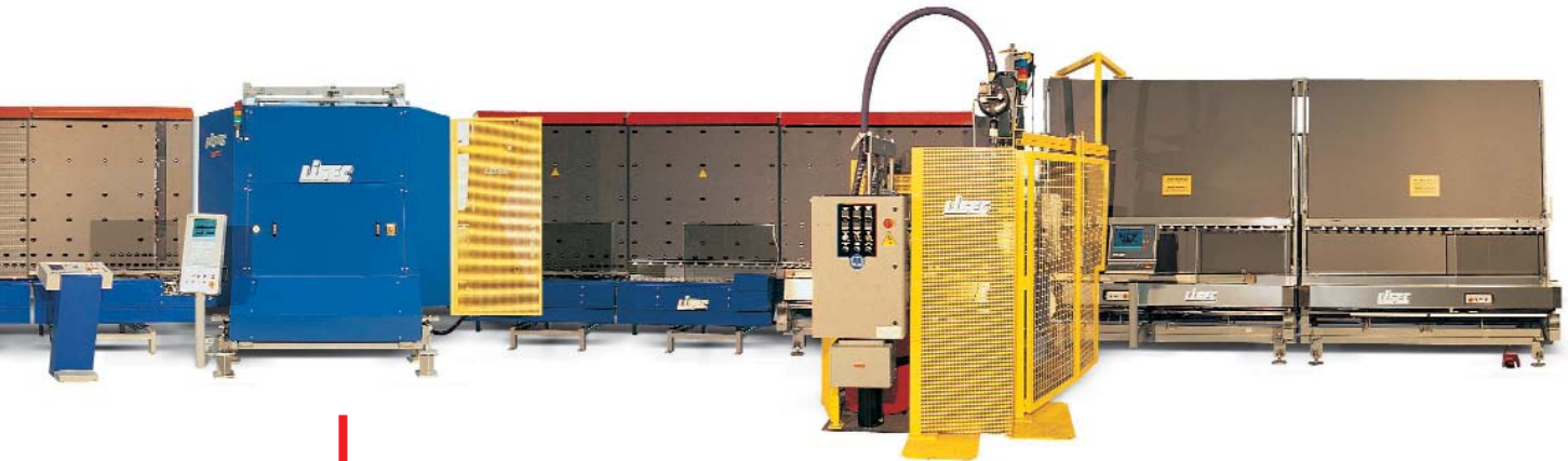
Automatic Combined Gas Filling/Assembly Press